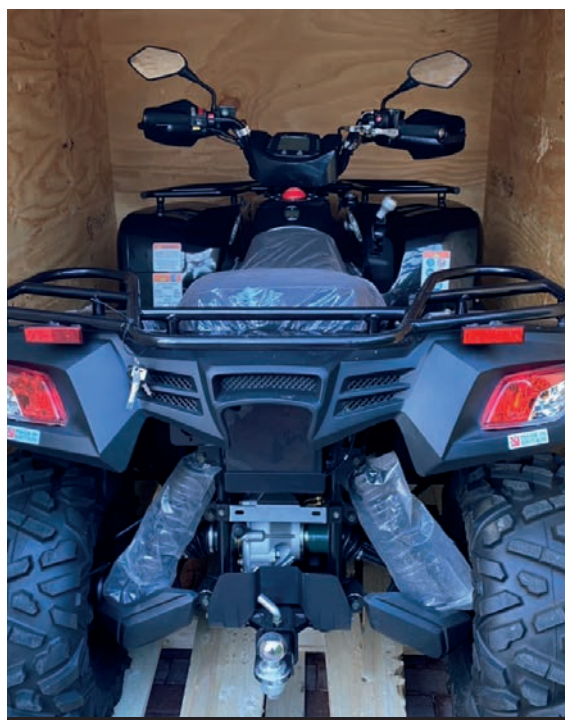
An Eco Charger Lithium Power 4WD leaving for Spain